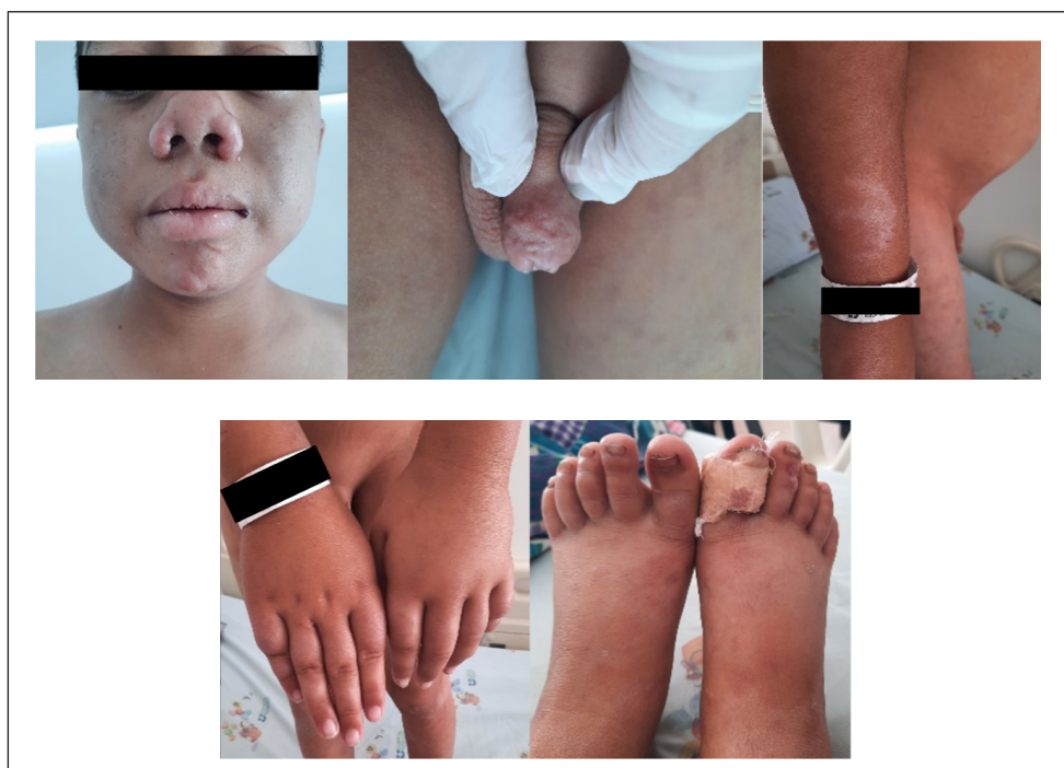
Figure 1. Leonine facies and nodules in extremities and penis

Upon evaluating the clinical findings of thickened skin, hypopigmented regions, and widespread nodular lesions on the nose, cheeks, chin, forehead, and ear pinnae resembling leonine facies, leprosy was suspected. A slit-skin sample confirmed leprosy histologically and was positive for Hansen's bacillus, with a bacillary index of 2.5. Multiple lesions were classified as multibacillary lepromatous leprosy according to WHO classification, prompting treatment with clofazimine, rifampicin, and dapsone. Following treatment initiation, rapid clinical improvement and favorable paraclinical results